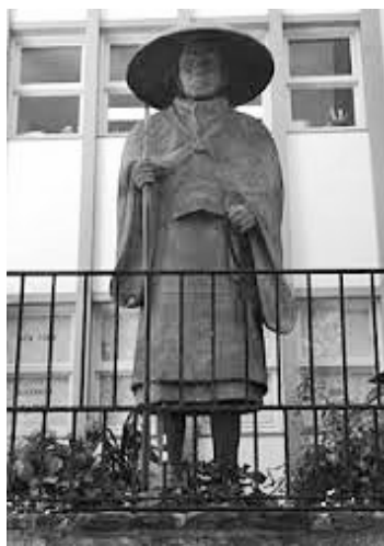
Adapted from Oneness, the Kapaa Hongwanji Mission newsletter

There was a Chinese monk Kyogen (Xiangyan in Chinese), who lived during the Tang Dynasty. He was known to be a very smart person. His master, Isan (Guishan in Chinese), recognized Kyogen's exceptional potential and sought to help him reach enlightenment. One day, Master Isan told Kyogen, "You are intelligent and erudite; you hear one, you understand ten, you hear ten, you understand one hundred. But I am not interested in the amount of knowledge you have gained from studies, or the breadth of information you have learned from scriptures and books." After a slight pause, Master Isan added, "I would like to hear your words from before you were born. Before you knew East and West."